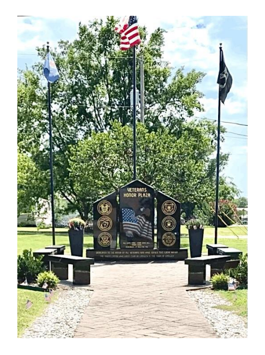
Veterans Honor Plaza in Langley, OK

The Lakeside Garden Club of Ketchum, OK, will maintain the Veterans Honor Plaza and these additions.