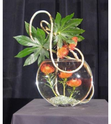
Under Water Design